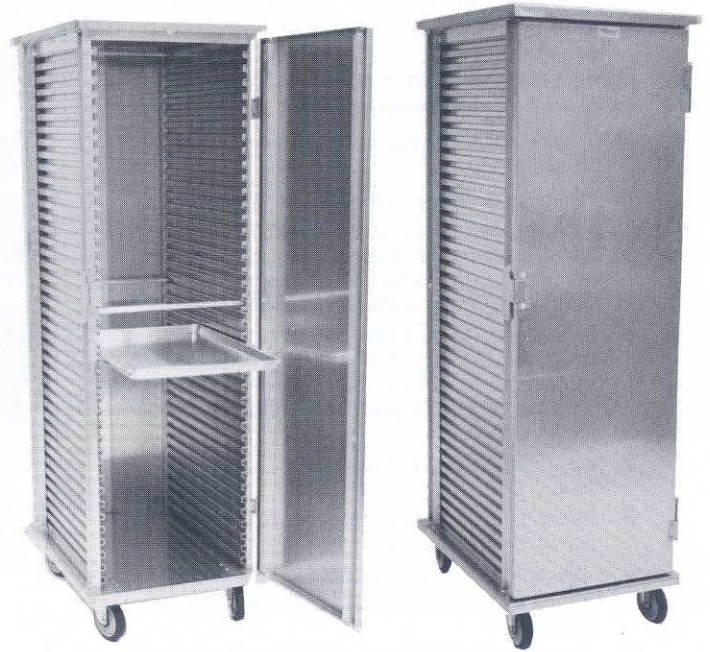
Heavy Duty Model 9105-HD-1839