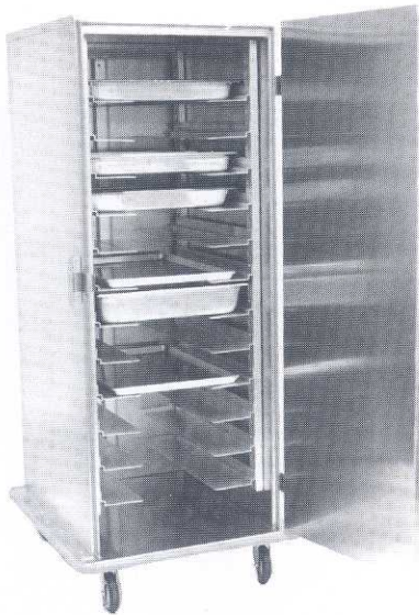
Insulated Model 9152-IN-13 With Optional Wrap Around Bumper

These cabinets use universal angle which can hold 18"x26" bun pans, 14"x18" trays, 12"x20" steam pans, gastronorm (GN 2/1 and GN 1/1) pans, 10"x20" or 20"x22" roasting and baking pans and various other sizes. These angles are normally placed on 4 1/2" centers and are adjustable on 1 1/2" centers.