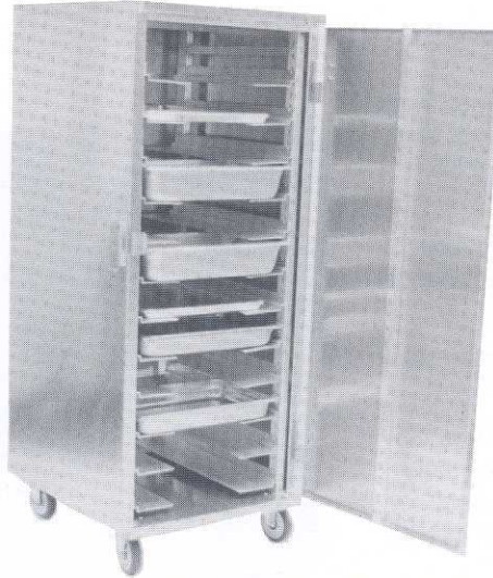
Non-Insulated Model 9150-12

Specifications: Hi-tensile aluminum construction. Uprights are 2"x1"x1/4" extruded channels and slides are 0.105" thick step angle type adjustable on 1 1/2" centers (fixed optional). Doors are removable and use heavy duty stainless steel hinges and latches. 5" deluxe swivel casters are standard. Non insulated models use fixed racks and 270° door swing and single wall construction with 0.080" thick sides, back, door and top and 0.190" thick deck. Insulated models use 0.063" thick double wall construction with fiberglass insulation and removable rack. Deck is heavy duty reinforced.