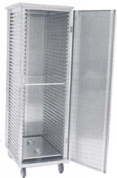
Corrugated Side Cabinet Model 9105-37-CR