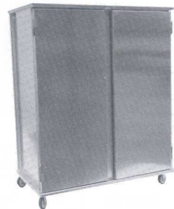
Double Section Cabinet 9156-D-OT-20