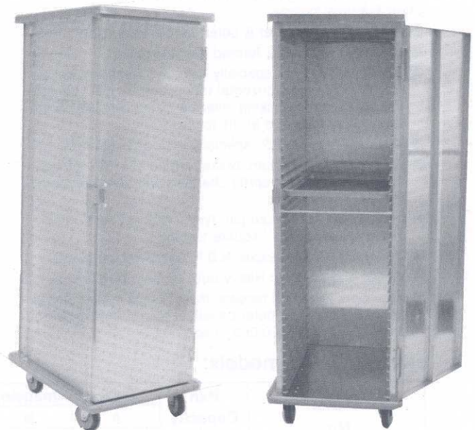
Model 9220-1839 with optional wrap around bumper