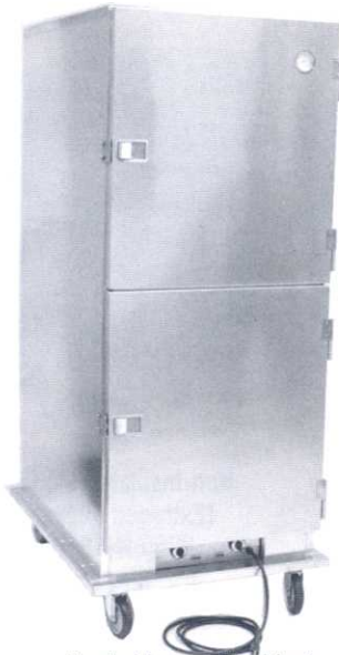
Heated banquet cabinet Model 9412-HIN-DD-BQ-90 with dutch doors for nested plates & covers

Thermometer: Through the door type with dial on the outside for easy reading of temperature without opening the door.