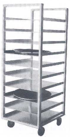
Single Rack With Solid Shelves Model S-4358-308