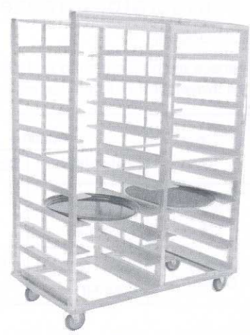
Double Rack Model S-4358-D-20 (with optional pan stops & perimeter bumper)

These racks are constructed of hi-tensile aluminum, are easy to clean and are heli-arc welded for extra strength & durability. The ultra wide supports prevent trays from falling thru, irrespective of their position.