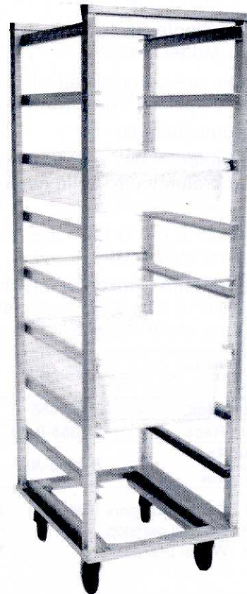
Heavy Duty Model 9583-HD-8