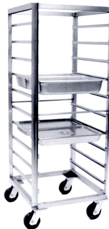
Heavy Duty Model 2089-HD-20