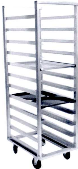
Single Rack Model 9584-1424