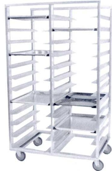
Double Rack Model 9172-1824