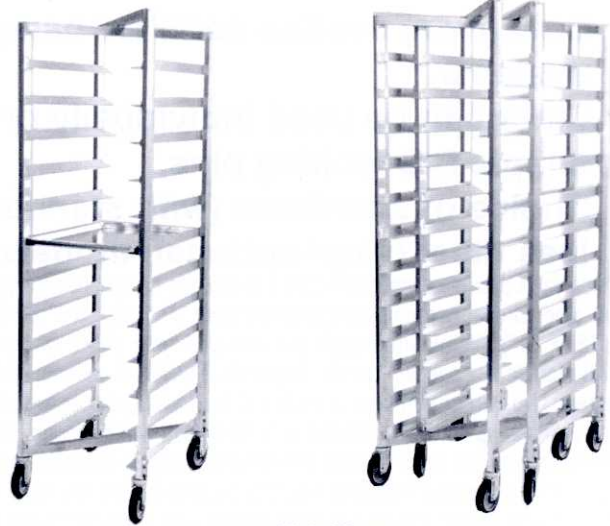
Angle Slide Type Nesting Racks MODEL 9589-N-12