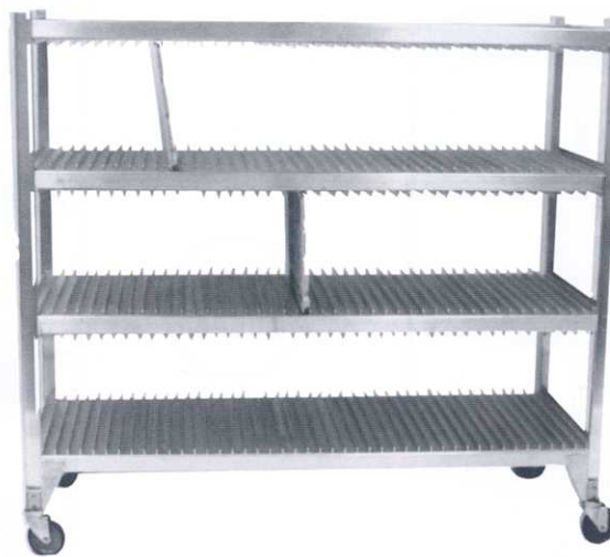
Model 9040-264-FR10 (with fixed extruded side panels)