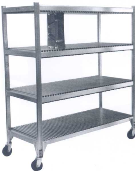
Model 9040-264-11 (with removable corrugated shelves)

These racks are designed to facilitate air drying. Corrugated shelves allow trays to be spaced on 1 1/4" centers and both shelves are removable without the use of any tools. Extra heavy duty models use extruded side panels which are welded to the frame and which allow trays to be stored on 1 1/2" centers. Both type of units are shipped completely assembled.