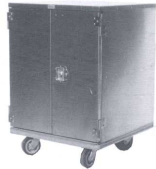
2 Compartment Heavy Duty Stainless Steel Model 2008-2-HD-3132-LL