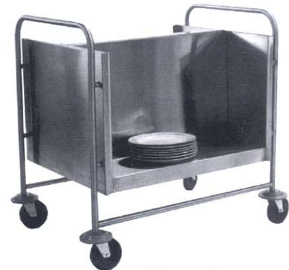
2191-2-324 (with optional round bumpers)