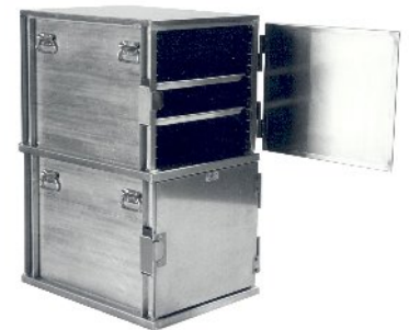
9264-1826 (shown 2 stacked)