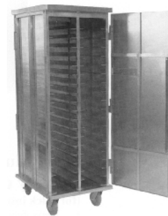
STYLE "B" 9156-HD-1014-76

(shown with optional correctional package)