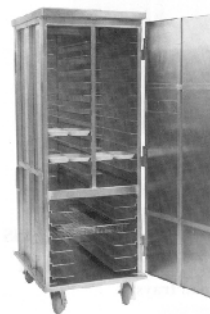
STYLE "A" 9156-HD-UA-10-48

Style B = All food trays (no wire baskets)