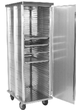
9240-HD-1839 (with correctional package)

*Cabinets also available with slides on 2¼", 4½" or 5⅞" centers. Will affect capacity. Please consult factory. For options, see Table BB-1