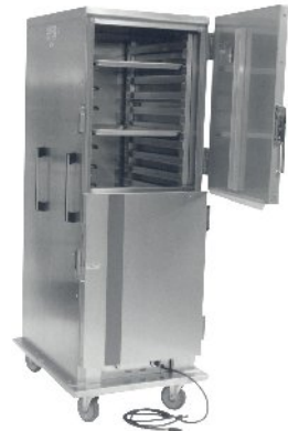
9252-HIN-DD-1834 (with optional push handles)