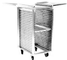
9586-CS-CR-18 (Outrigger Type)