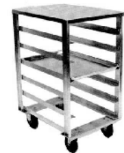
9586-ST-LS-6 (Table Top Type)