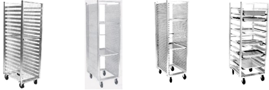
CATALOG PAGE D-13