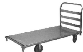
6275-SS (removable handle)