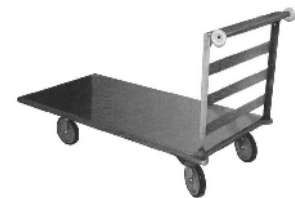
6271-SS (fixed handle)