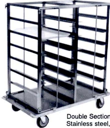
Double Section Rack, Stainless steel, Model 2585-D-1614 with Optional Solid Deck, Swing Gates and corner bumpers.