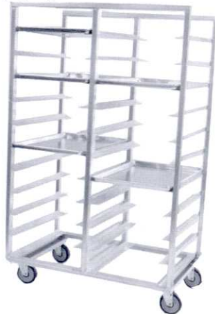
Double Section Rack, aluminum, Model 9585-D-1822

These racks are available for various tray sizes. Uprights are 2"x1" channels or 1" square tubing. Slides are heavy gauge aluminum or stainless steel. Racks come fully assembled with 5" deluxe all swivel casters.